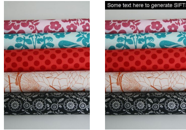
Figure 2: The original and the modified images.

modified images. This means the attacked images are further away in the feature space, offering opportunities for reducing the recognition quality of the system.