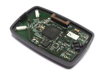
Figure 2. CAIRN's Zyggie platform for WBSN