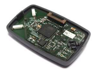
Figure 2. CAIRN's Ziggie platform for WBSN